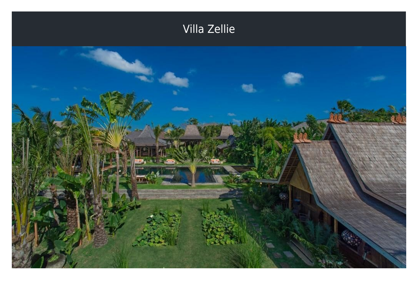
Villa Zelie is a cluster of about 10 pavilions that represents traditional Balinese architecture especially with the prominent Joglo roofs as the predominant structural element.

5 Bedrooms Sleeps 10 Located in Canggu, Bali